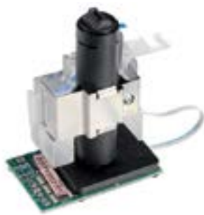
HP Optical Media Advance Sensor (OMAS)

HP Double Swath Technology provides breakthrough speed and performance. The HP Designjet Z6600 Production Printer includes two sets of three HP 771 and HP 773 Designjet Printheads, creating a wide print swath—up to 1.67 inches/42.5 mm—and a high firing frequency to deliver prints with amazing speed. Six bi-color printheads feature 1,056 nozzles per color, 1200 nozzles per inch, and small drop volumes for top photo quality.